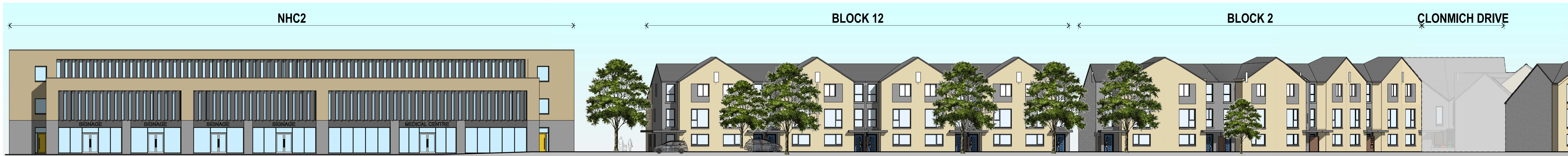
6 Crofton Avenue (South) - Part 03 1 : 200

CPR Note: All works to be carried out using proper materials which are fit for the use they are intended and for the condition in which they are to be used.