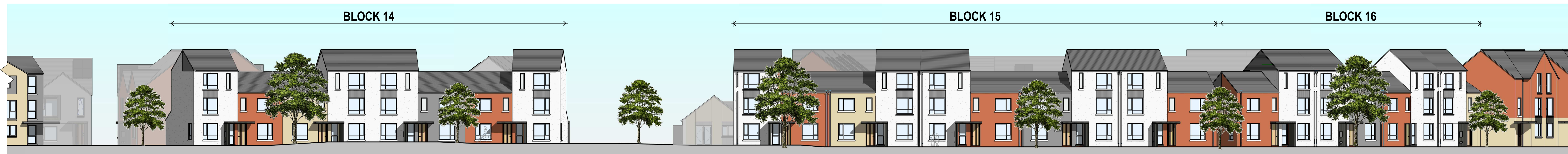
3 Crofton Avenue (North) - Part 02 1 : 200