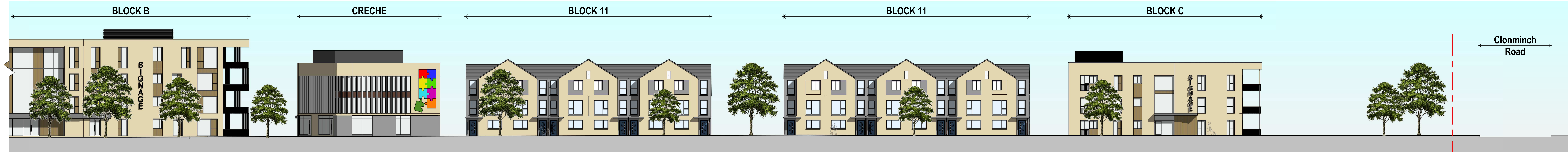
4 Crofton Avenue (South) - Part 01 1 : 200