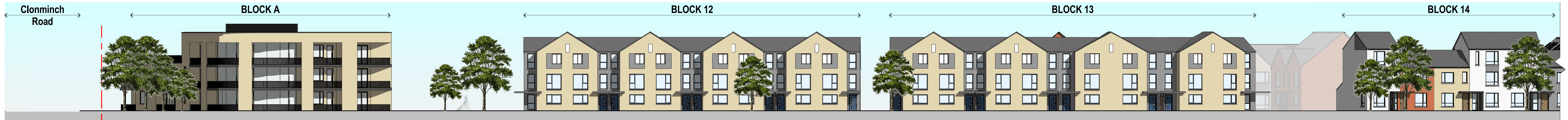
2 Crofton Avenue (North) - Part 01 1 : 200