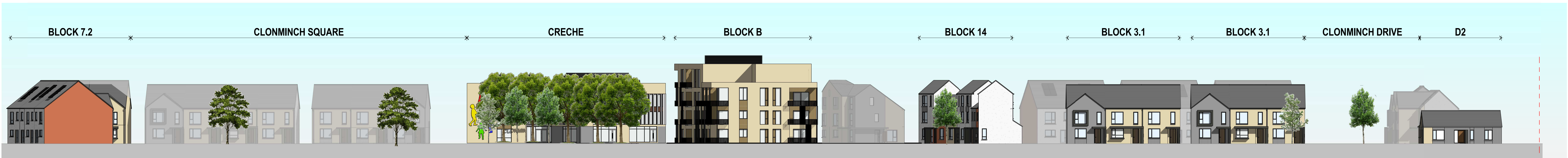
2 Section B-B 1:250