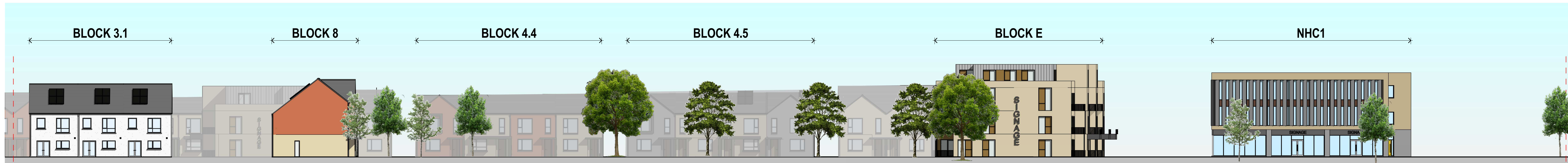
3 Section C-C 1:250