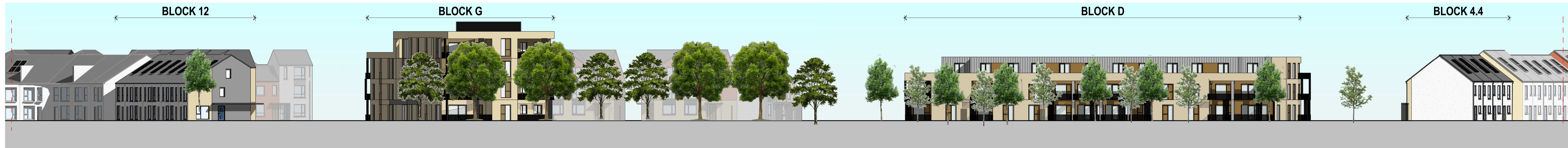
4 Section D-D 1:250