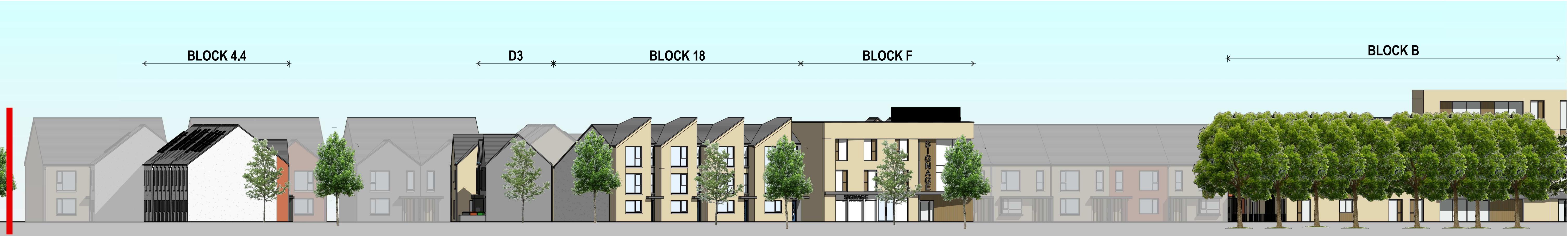
2 Site Section A-A Part 01 1 : 200