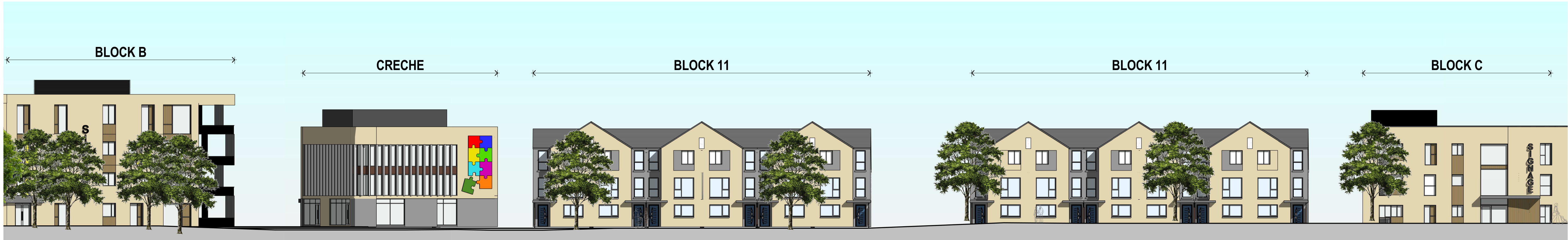
3 Site Section A-A Part 02 1 : 200