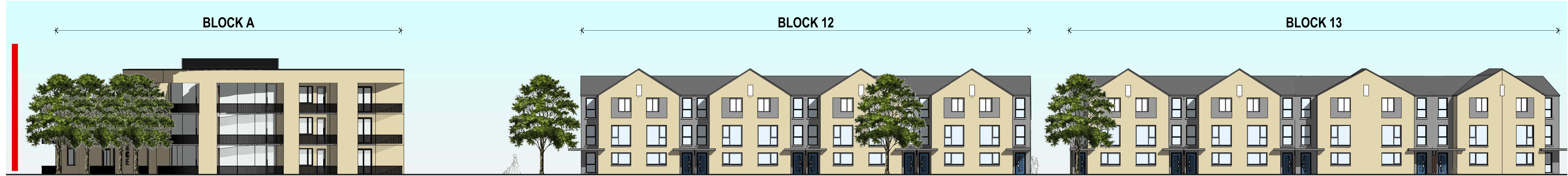
2 Site Section B-B Part 01 1 : 200