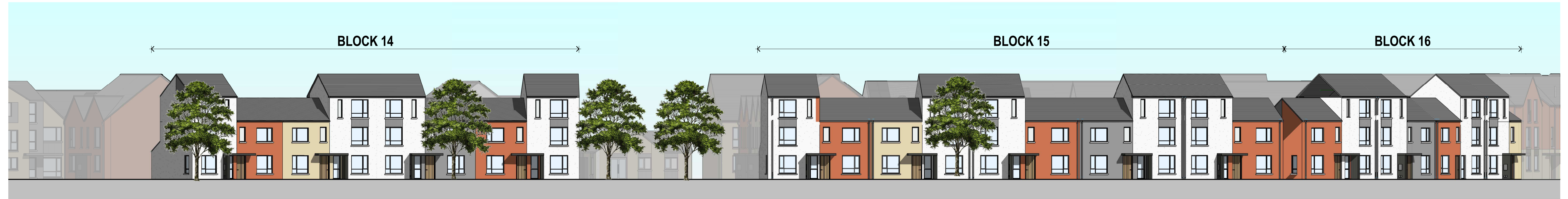
3 Site Section B-B Part 02 1 : 200