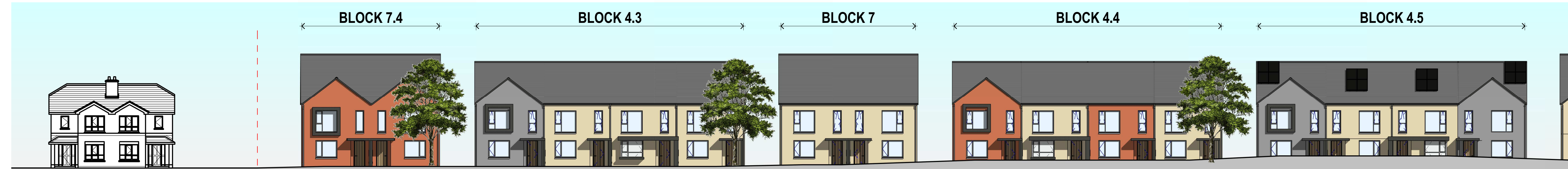
2 Site Section C-C Part 01 1 : 200