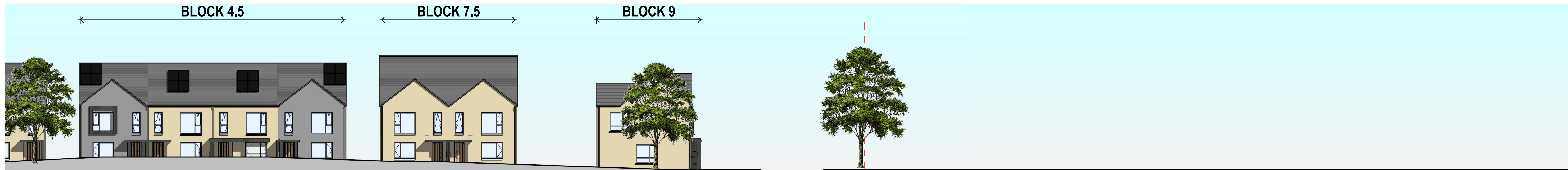
3 Site Section C-C Part 02 1 : 200