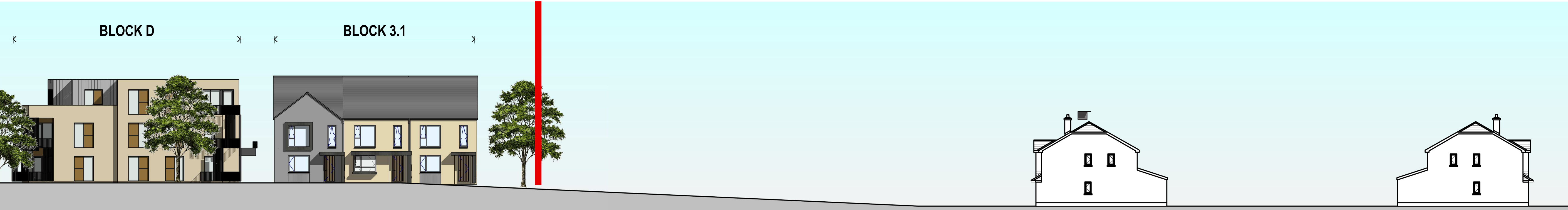
3 Site Section D-D Part 02 1 : 200