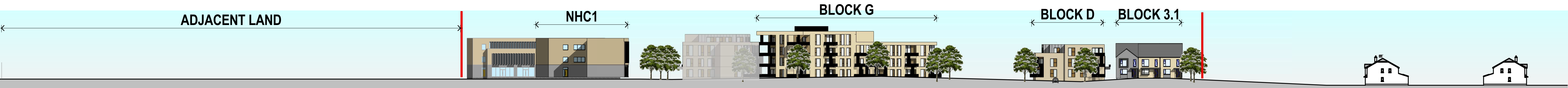
1 Site Section D-D 1 : 600