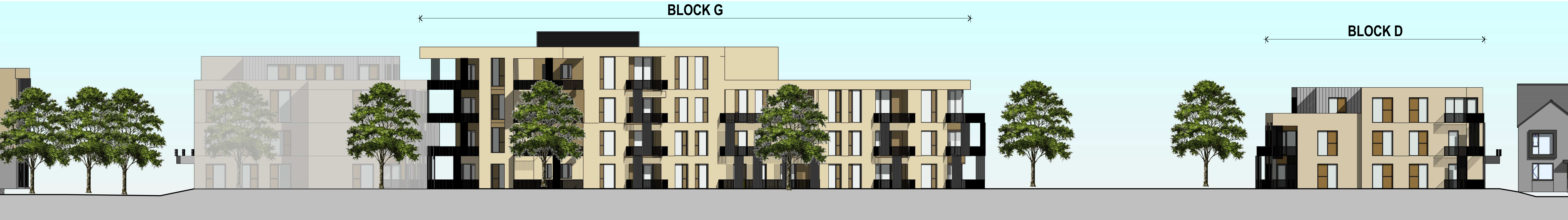
2 Site Section D-D Part 01 1 : 200