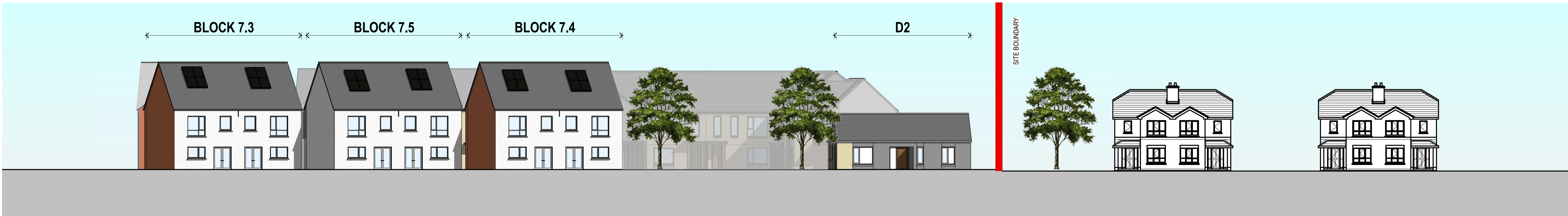
3 Site Section F-F Part 02 1 : 200