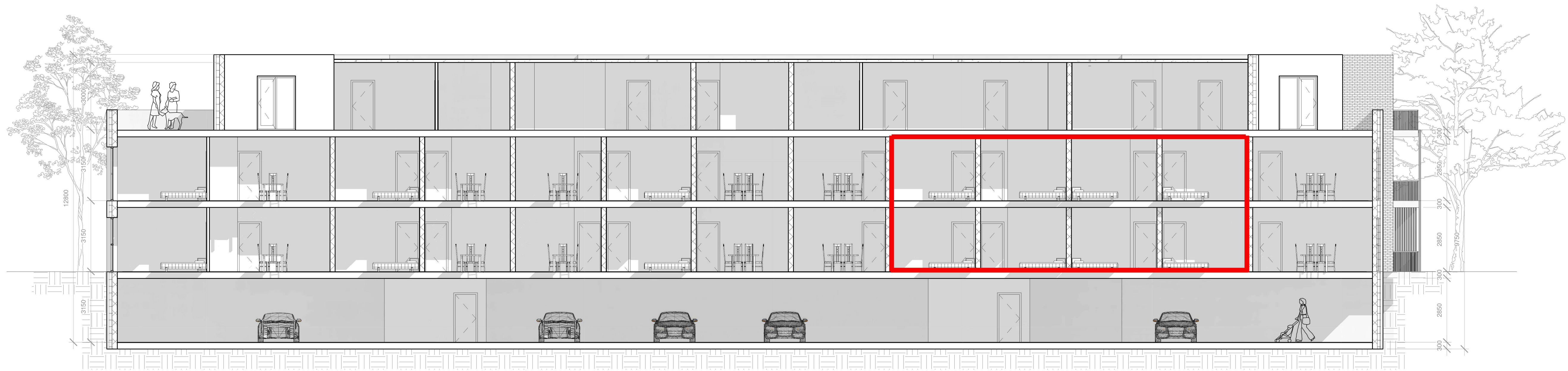
1 Building Section 1 1 : 100