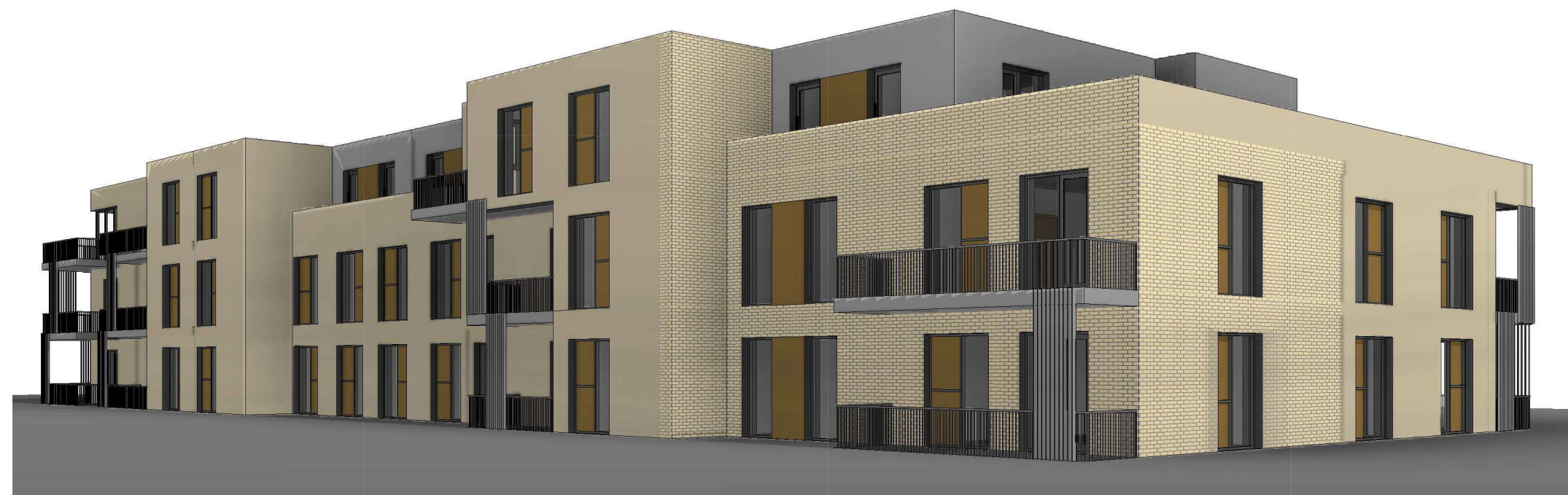
2 3D View 1..

NOTE: Levels shown on architectural block plans relate to local Ground Floor Level and do not relate to Ordnance Datum. For Finished Ground Floor Levels related to Ordnance Datum see DBFL Engineers drawings numbered: 1800002-2000 Roads Layout / 1800002-2001 Roads Layout Sheet 1 / 1800002-2002 Roads Layout Sheet 2