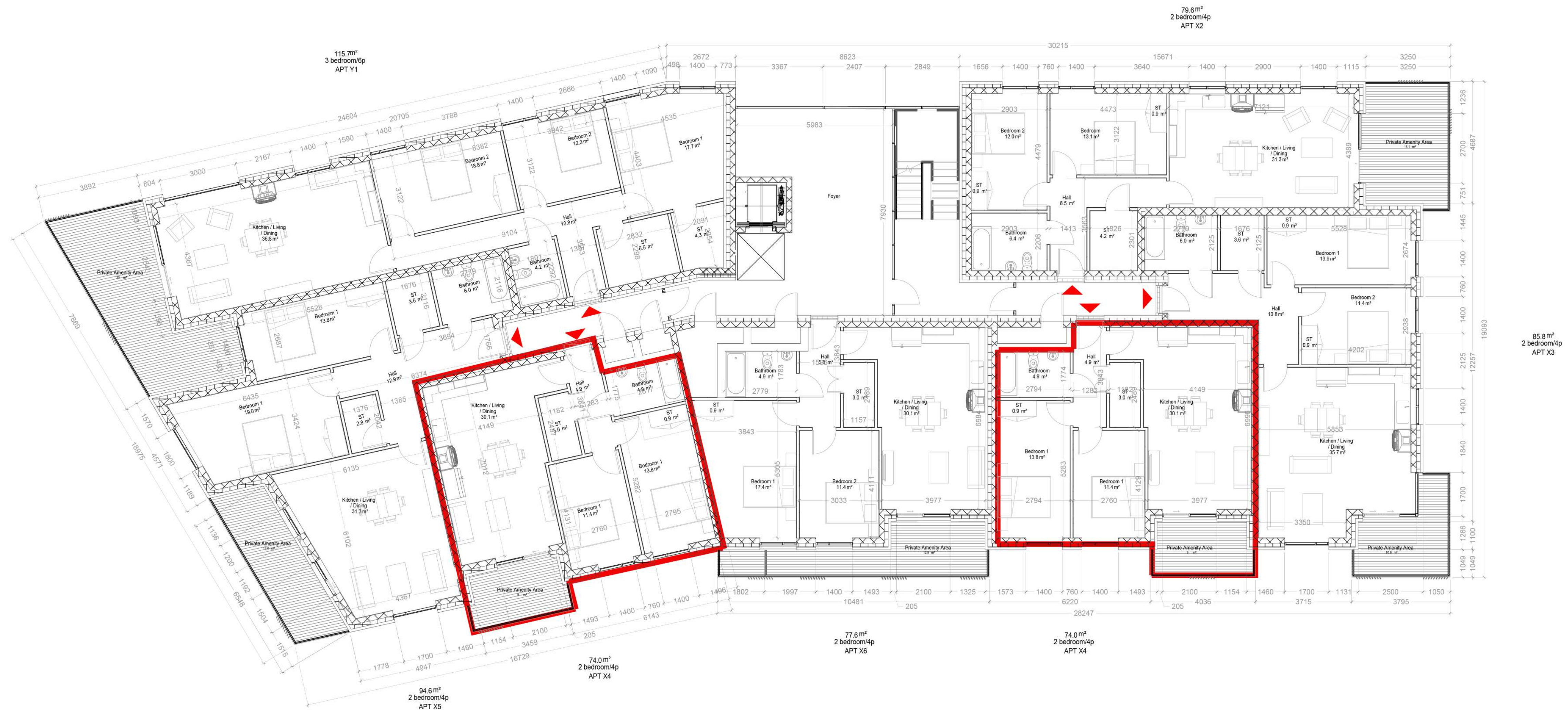
Block B -First Floor Plan