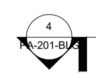
Block G - Roof Plan 1:100