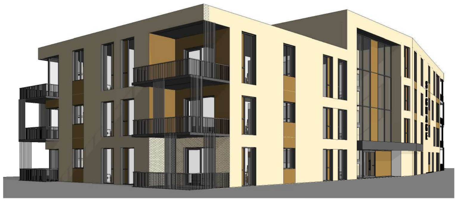
4 3D View 1.