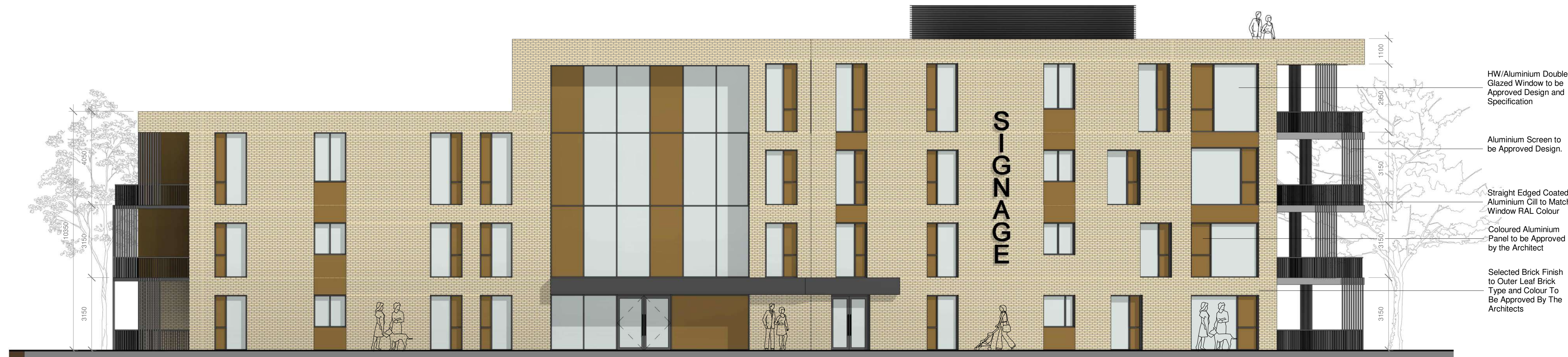
1 BLOCK B - North Elevation 1 : 100