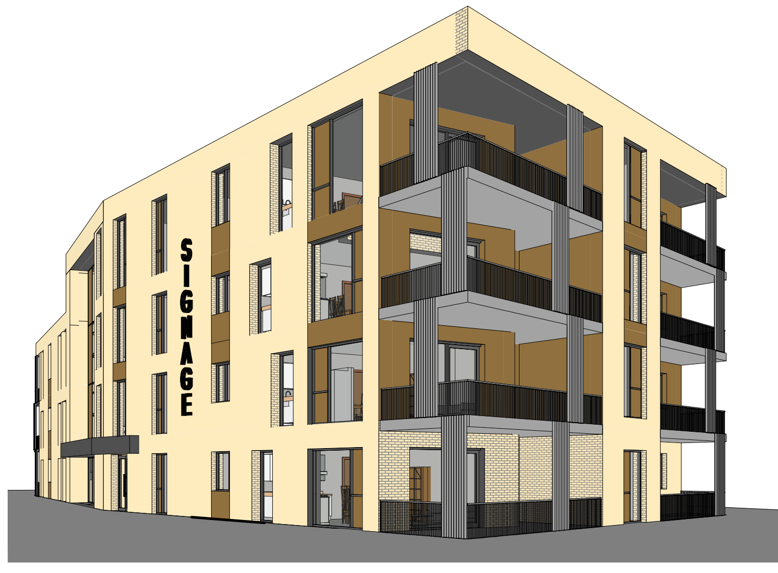
3 3D View 2.