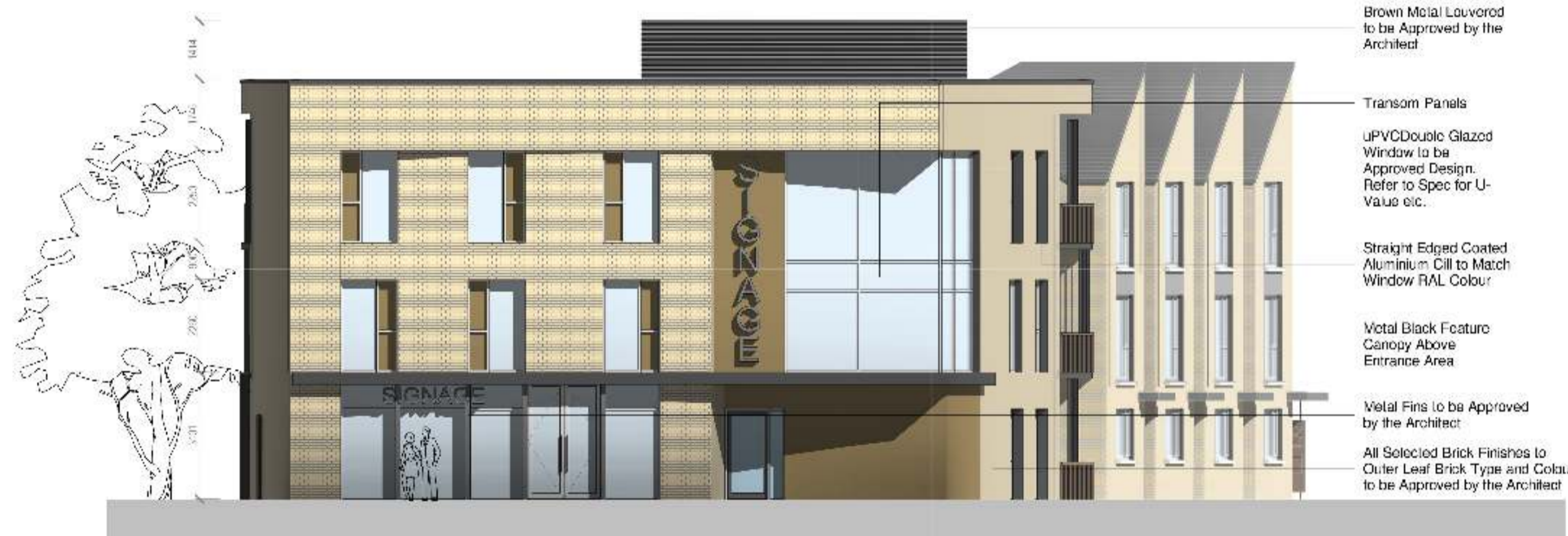
2 Block F - North Elevation 1:100

Main bedroom area 13m 2 . Double room 11.4m 2 (2.8m minimum width). Single 7.1m 2 (2.1m minimum width)