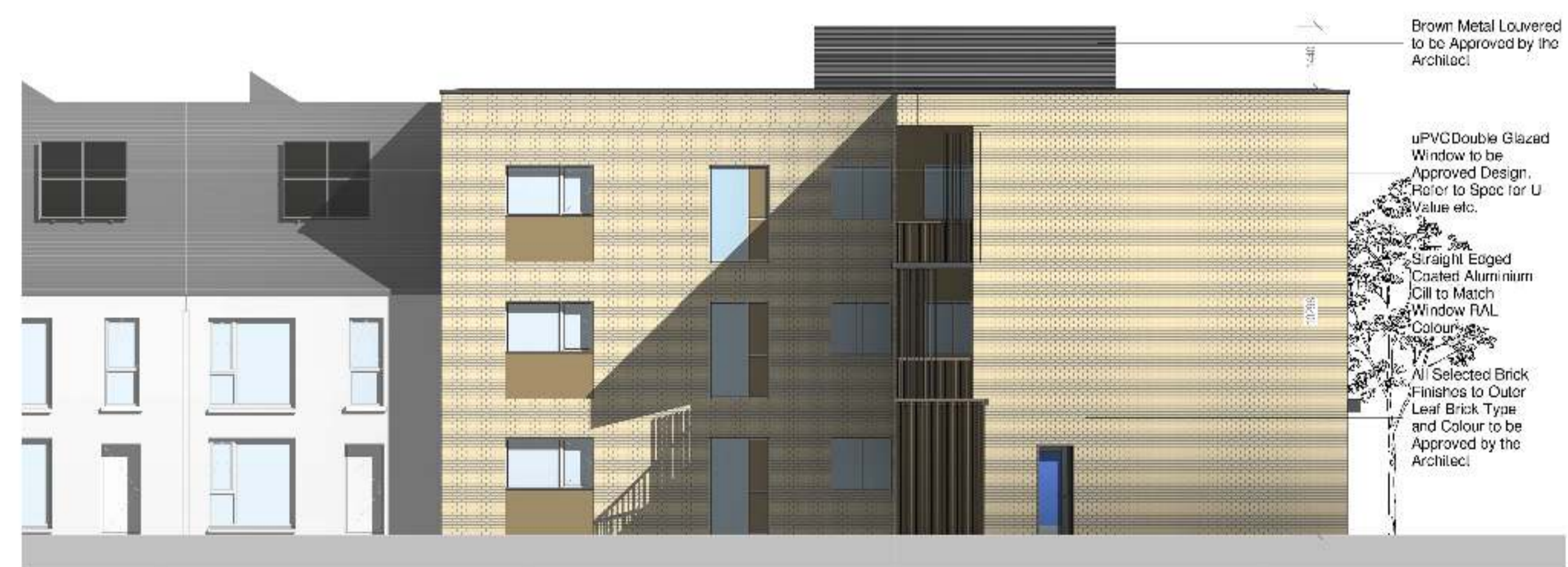
3 Block F - East Elevation 1:100