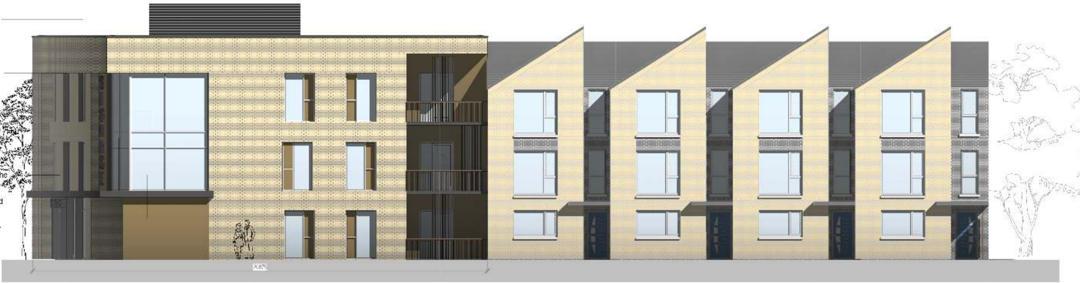
1 Block F - West Elevation 1:100

uPVC Double Glazed Window to be Approved Design. Refer to Spec for U-Value etc.