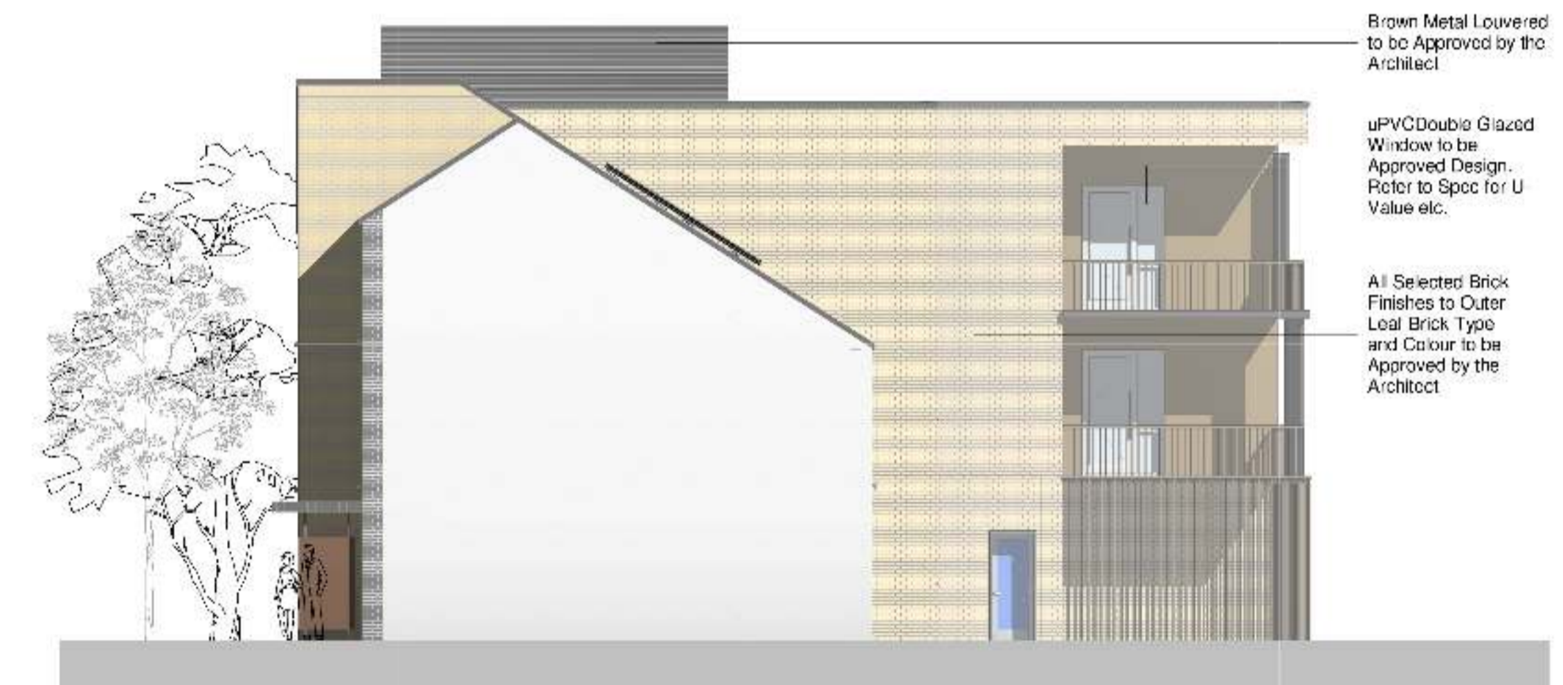
4 Block F - South Elevation 1:100