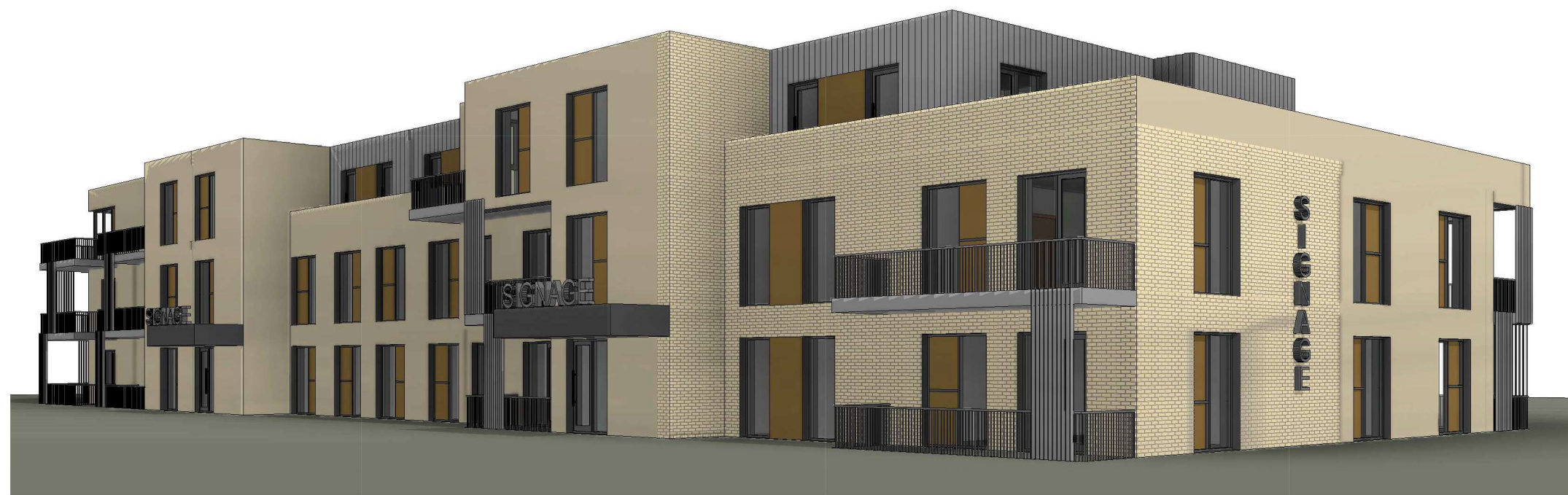
2 3D View 1..

NOTE: Levels shown on architectural block plans relate to local Ground Floor Level and do not relate to Ordnance Datum. For Finished Ground Floor Levels related to Ordnance Datum see DBFL Engineers drawings numbered: 1800002-2000 Roads Layout / 1800002-2001 Roads Layout Sheet 1 / 1800002-2002 Roads Layout Sheet 2