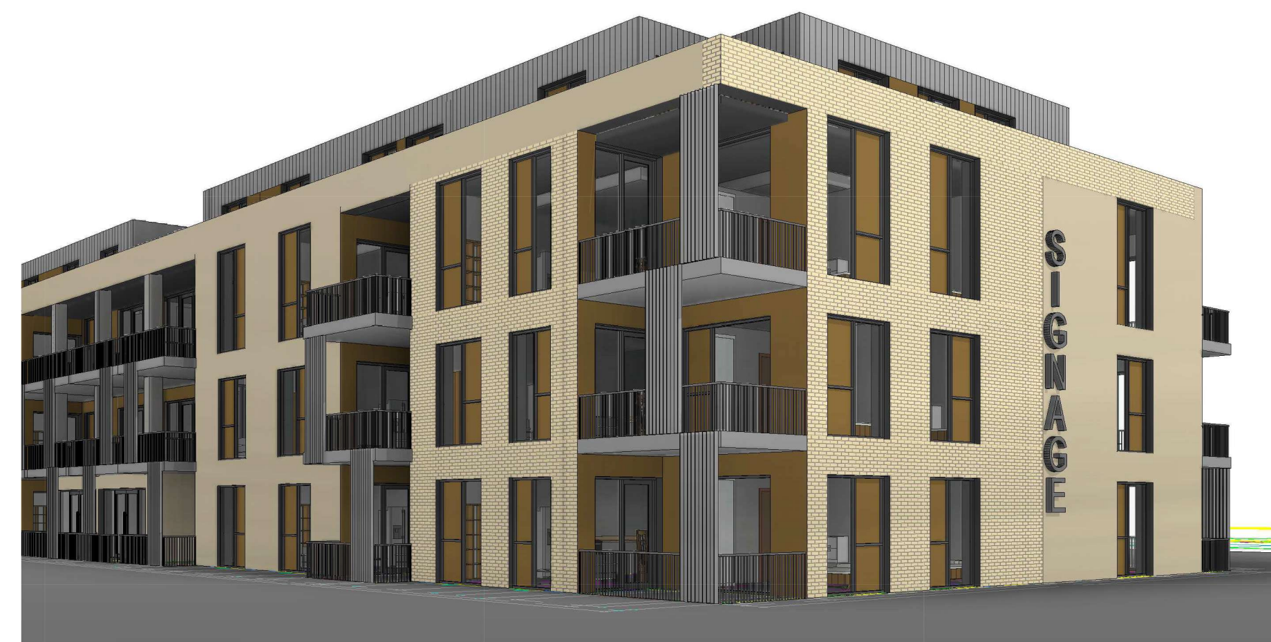
3 3D View.

NOTE: Levels shown on architectural block plans relate to local Ground Floor Level and do not relate to Ordnance Datum. For Finished Ground Floor Levels related to Ordnance Datum see DBFL Engineers drawings numbered. 180002-2000 Roads Layout / 180002-2001 Roads Layout Sheet 1 / 180002-2002 Roads Layout Sheet 2