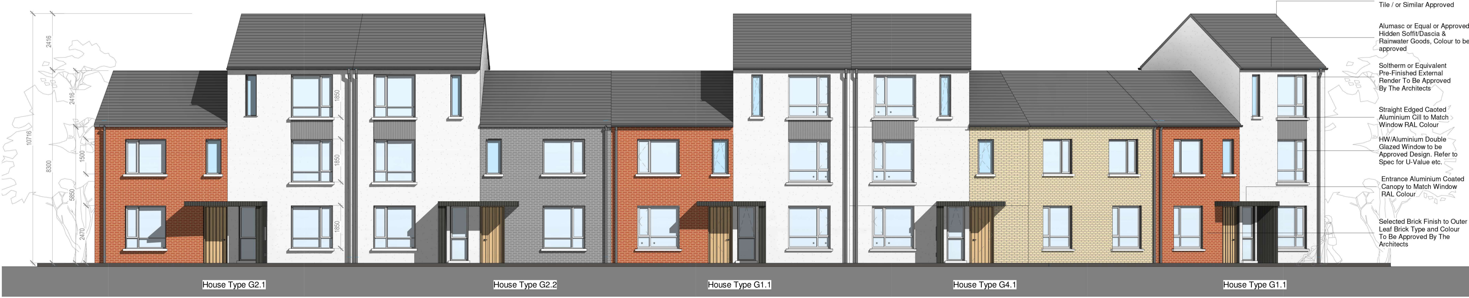
3 Block 16-G1- Front Elevation 1:100

HOUSE TYPE G1.1, G1.2 3 BEDROOM / 6 PERSON FLOOR AREA 128.6 M2 / 1384.3 SQFT