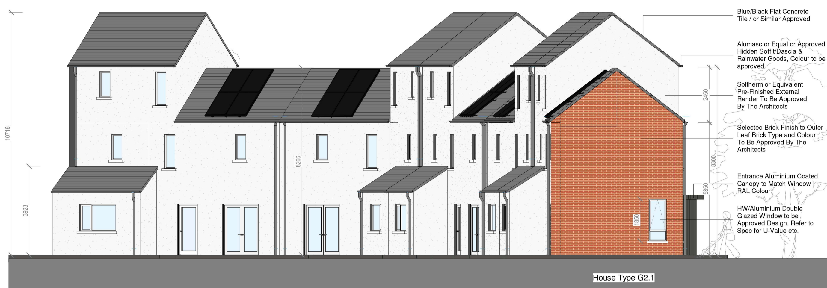
2 Block 16-G1- Side Elevation 1 1:100