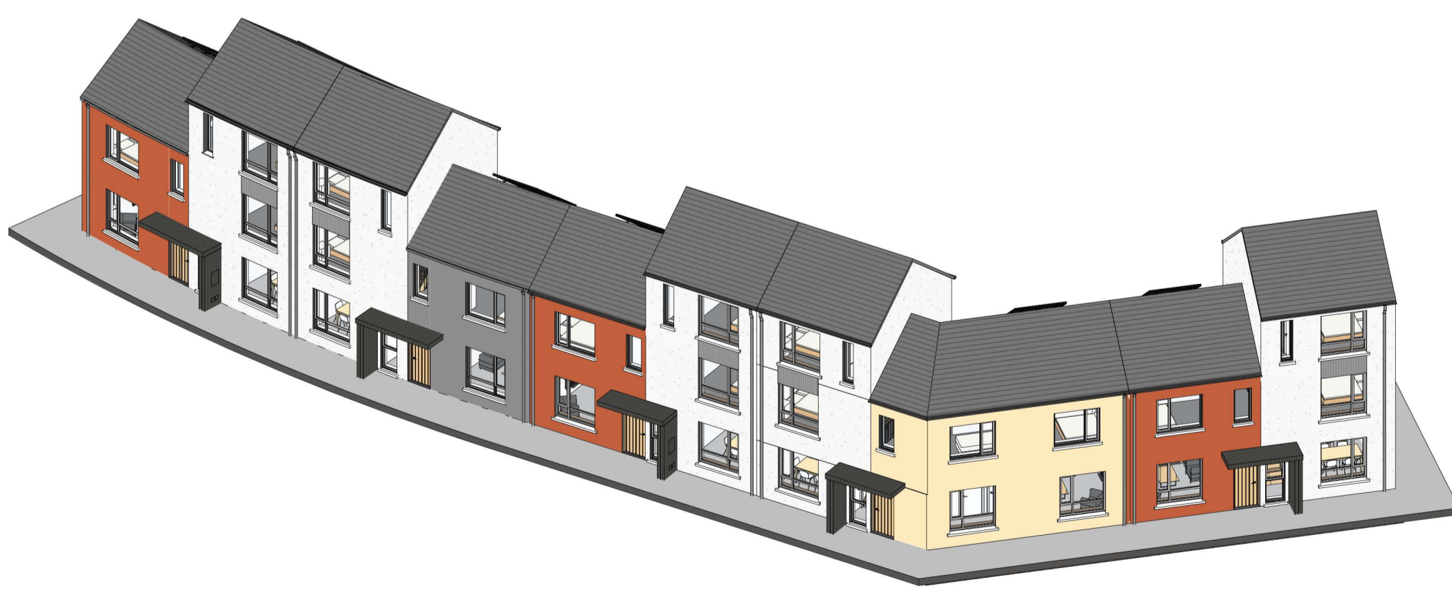
5 Block 16-G1- 3D View 1