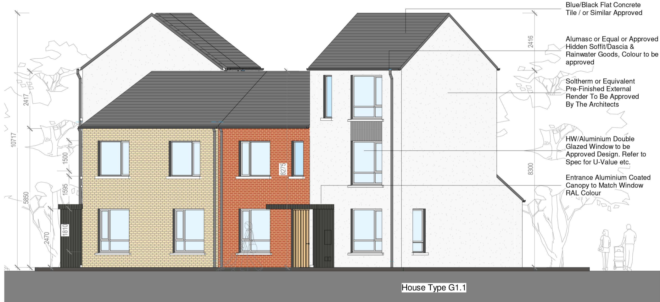
3 Block 16-G1- Side Elevation 2 1:100