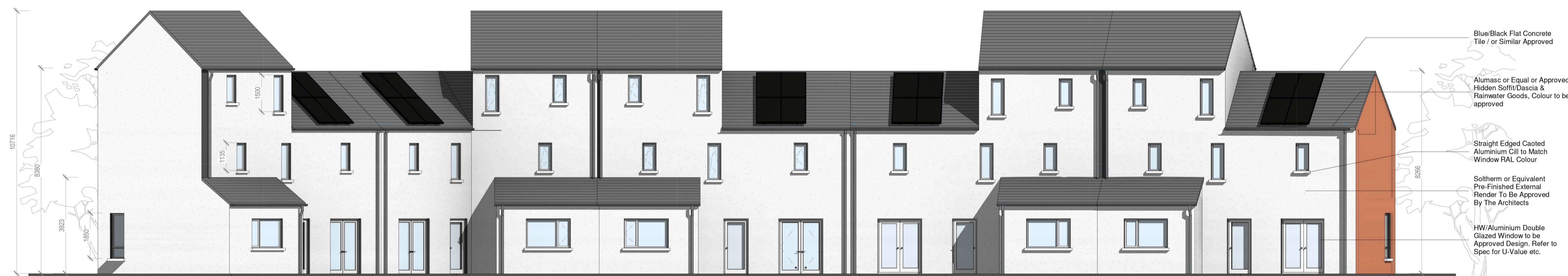
1 Block 16-G1- Rear Elevation 1:100