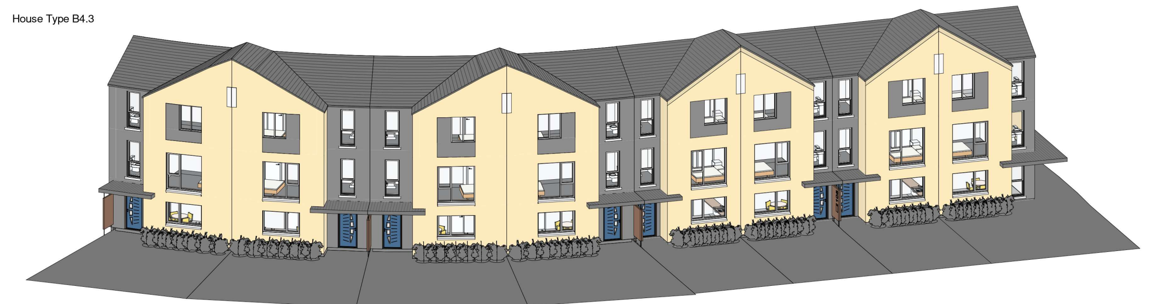
4 Block 2- 3D View