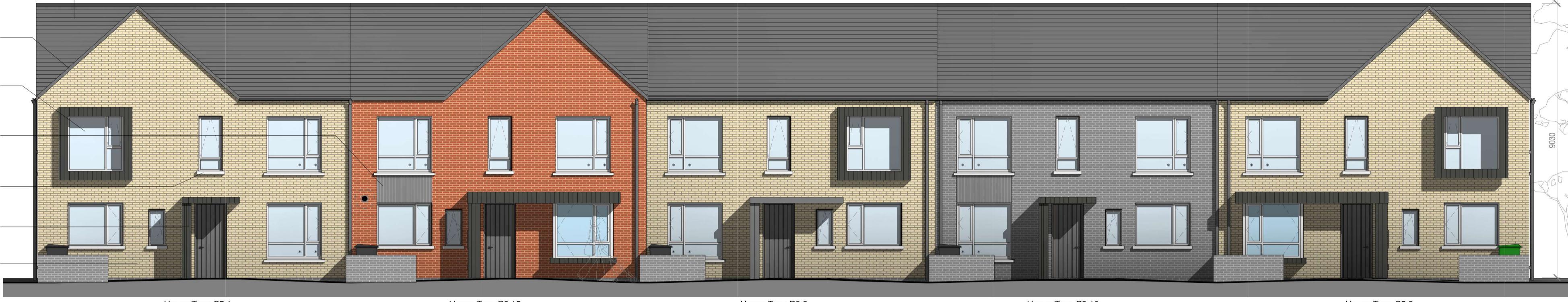
House Type C5.1 House Type B3.15 House Type B3.2 House Type B3.16 House Type C5.2