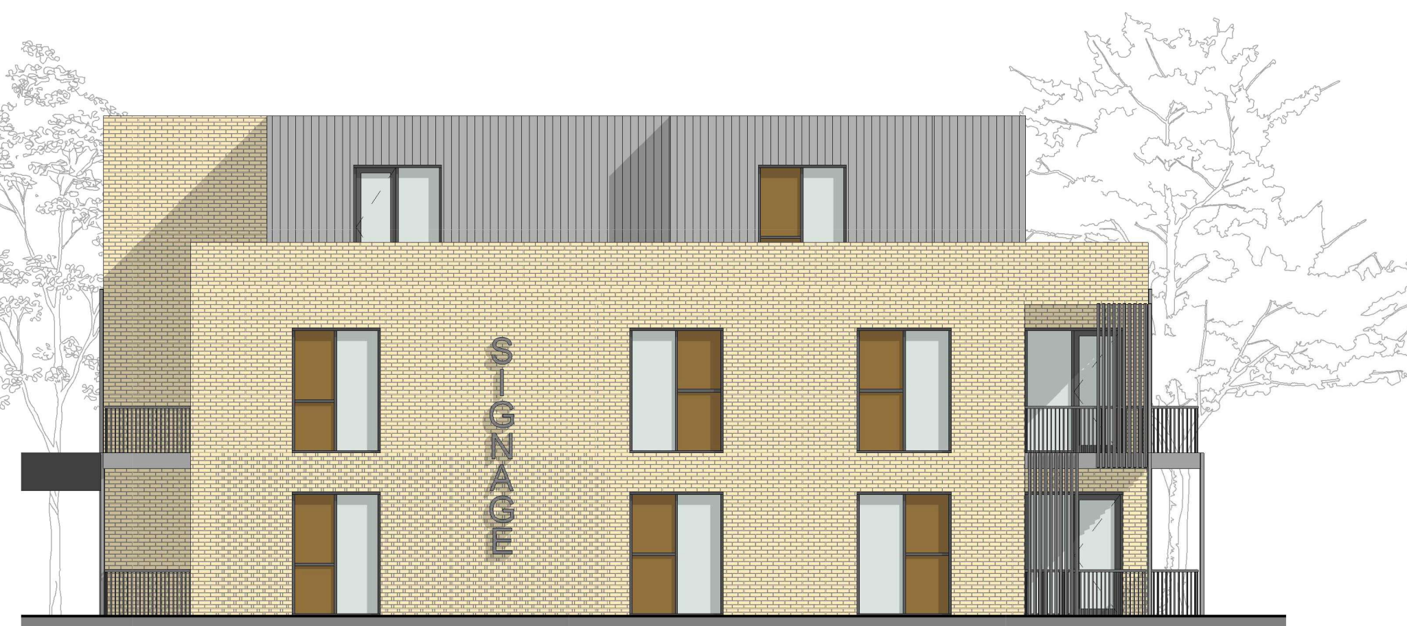
4 Building Elevation D 1 : 100