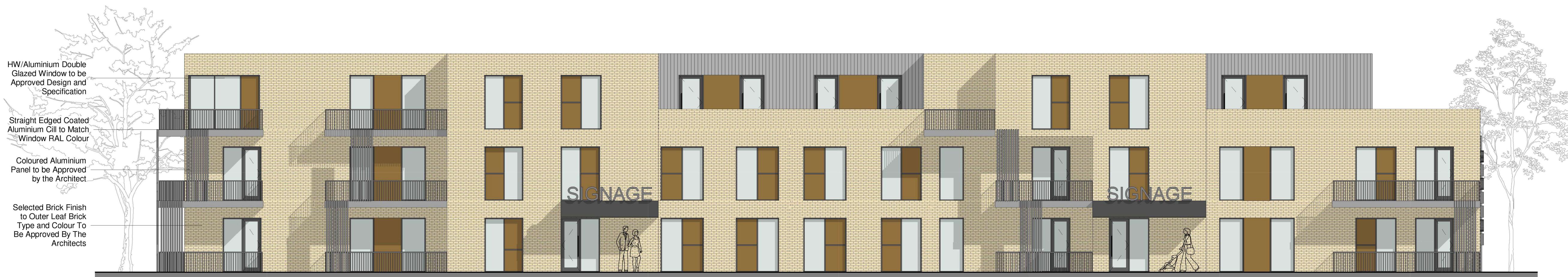
2 Building Elevation B 1 : 100