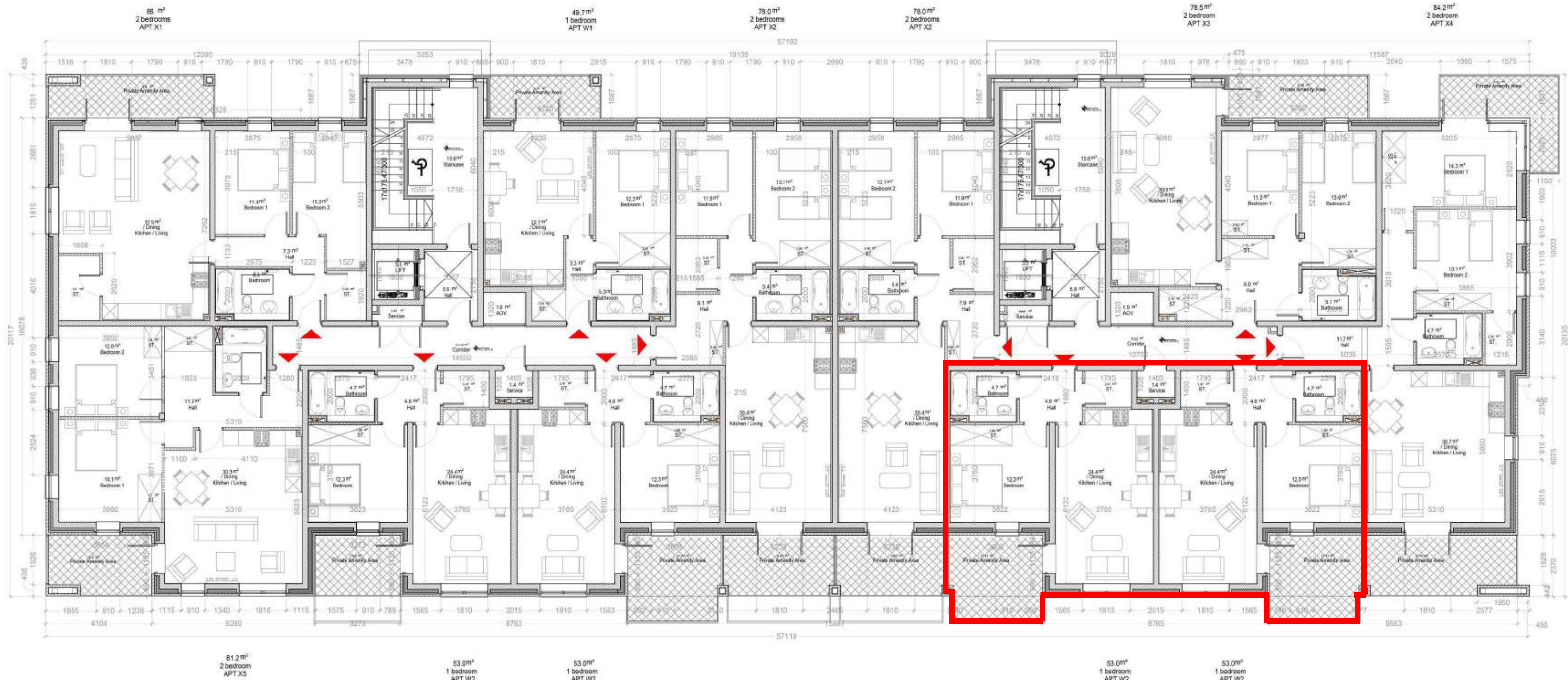
Block D -First Floor Plan 1:100