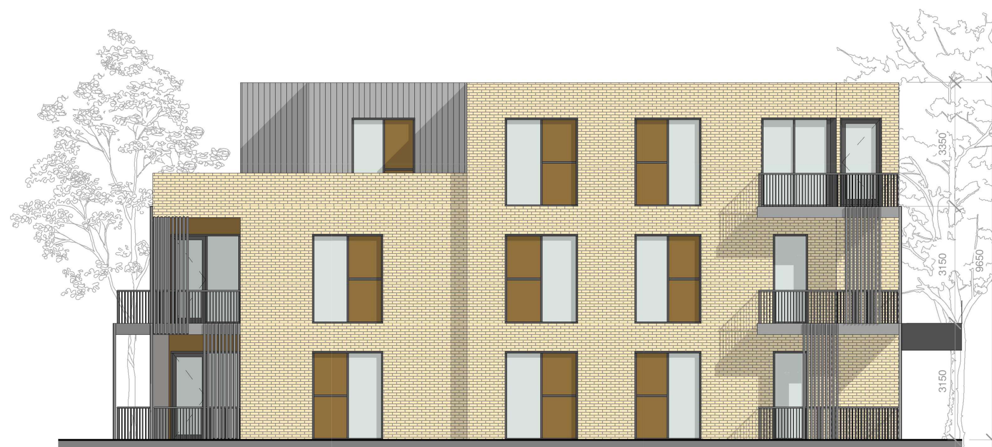
3 Building Elevation C 1 : 100