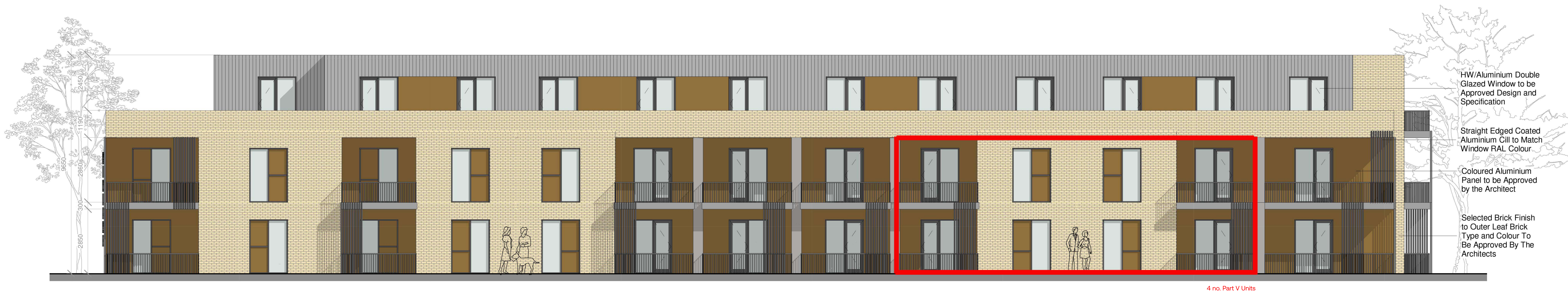
1 Building Elevation A 1 : 100